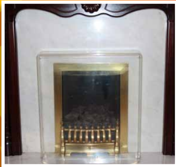
Fireplace Heatsaver with base stand